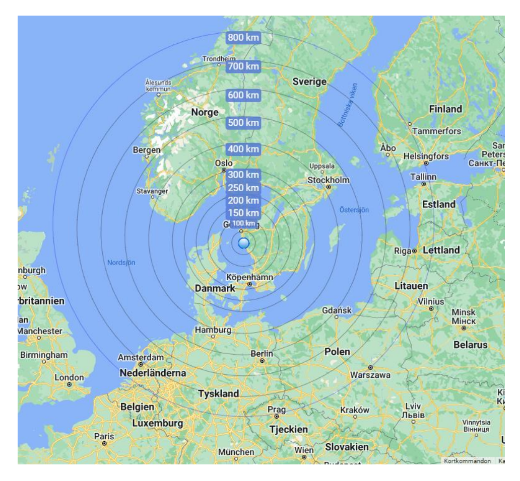
Figure 1. The land area around the site in question on the Värö Peninsula out to a radius of 800 km.

The land area considered is within a radius of up to 800 km from the site in question on the Värö Peninsula, please see Figure 1.