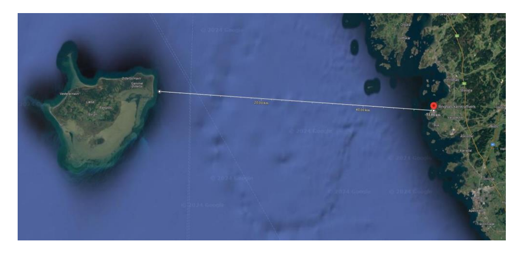
Figure 2. The map shows the distance, as the crow flies, between the Värö Peninsula and the Danish island of Läsö, taken from Google Maps. The distance between Värö Peninsula and Läsö is approximately 50 km.

The design of the proposed nuclear power plant has not been fully defined, so the calculations in this report are based on a conservative, generic source term<sup>1</sup>. Dispersion conditions and exposure data have been selected as far as possible in relation to the Nordic circumstances. The radiation dose caused by a radioactive release is different for children and adults because the exposure pathways are different for different age categories. For example, food intake differs between these groups. To cover the variations, this report presents results for one-year-old children and adults.